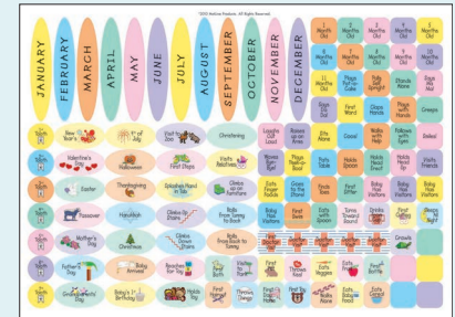
Colorful sticker sheet included

The undated My First Year Scrapbook Calendar was a great gift for the first time moms-to-be who participated in the birthing class preparing for the arrival of their new bundle of joy. The Pediatric Partners Clinic appreciated that the calendar was a gift that the baby wasn't going to outgrow and could become a keepsake for years to come. By keeping their name in front of the parents for the first year, it also reminded them to participate in the baby wellness program.