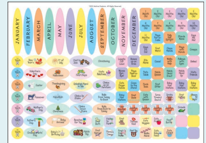
Colorful sticker sheet included

The undated My First Year Scrapbook Calendar was a great gift for the first time moms-to-be who participated in the birthing class preparing for the arrival of their new bundle of joy. The Pediatric Partners Clinic appreciated that the calendar was a gift that the baby wasn't going to outgrow and could become a keepsake for years to come. By keeping their name in front of the parents for the first year, it also reminded them to participate in the baby wellness program.