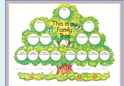
Sample of inside page