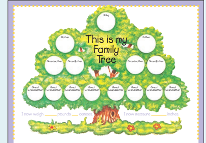
Sample of inside page