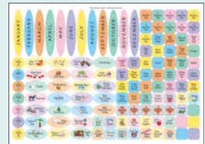
Colorful sticker sheet included

The non-dated My First Year Keepsake Calendar was a great gift for the first time moms-to-be who participated in the birthing class. The Pediatric Partners Clinic appreciated that the calendar was a gift the baby wouldn't outgrow. It will also keep their name in front of the parents for the first year reminding them to attend the baby wellness program.