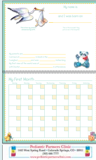
Available Option: 0351 (No Ad Copy)