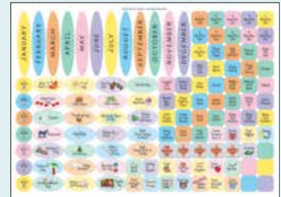
Colorful sticker sheet included

The undated My First Year Scrapbook Calendar was a great gift for the first time moms-to-be who participated in the birthing class preparing for the arrival of their new bundle of joy. The Pediatric Partners Clinic appreciated that the calendar was a gift that the baby wasn't going to outgrow and could become a keepsake for years to come. By keeping their name in front of the parents for the first year, it also reminded them to participate in the baby wellness program.